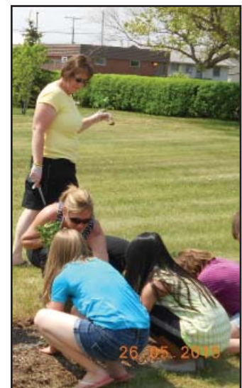
Hanley Pilot Project